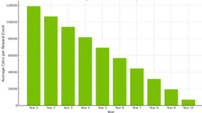
Average Meme Reward by Year

The number of coins gifting will drop each day and taper offer over the years (see below)